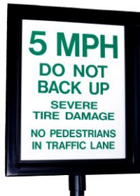
# 14100.100 Lighted

Signage - Warning signs are imperative to provide sufficient notice of the danger to drivers and to pedestrians and may be required by local ordinance. Illumination of the teeth, especially in areas adjacent to pedestrian traffic, is also important if the area will be accessible after daylight. Be sure your customer is aware of these inherent dangers.