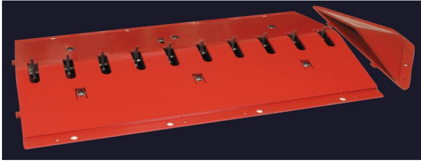
COBRA/KING COBRA Surface Mount with End Bevel