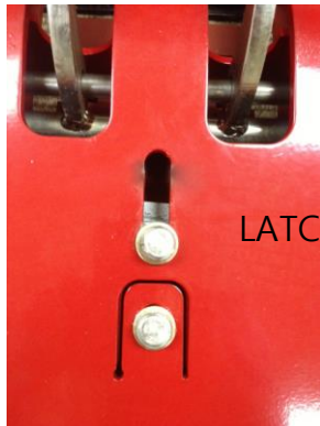
LATCH DOWN BOLT & ASSEMBLY

To activate the latch down use an adjustable wrench or 5/8" wrench. Loosen the latch down bolt then holding the two teeth sections down slide the latch down assembly up until under the teeth shaft. When in place tighten the bolt securely.