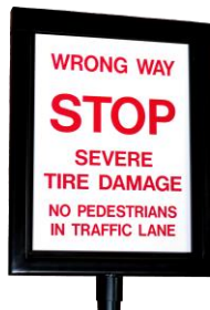
# 14110.100 Reflective

It is recommended to use Guardian Warning Sign Model 14100.100 (lighted) or 14110.100 (reflective) that warns drivers of the inherent danger of the device including a notice for pedestrian traffic to stay clear of the area. If there will be traffic after dark be sure to provide adequate lighting in the area and use the warning sign Guardian Model 14100.100.